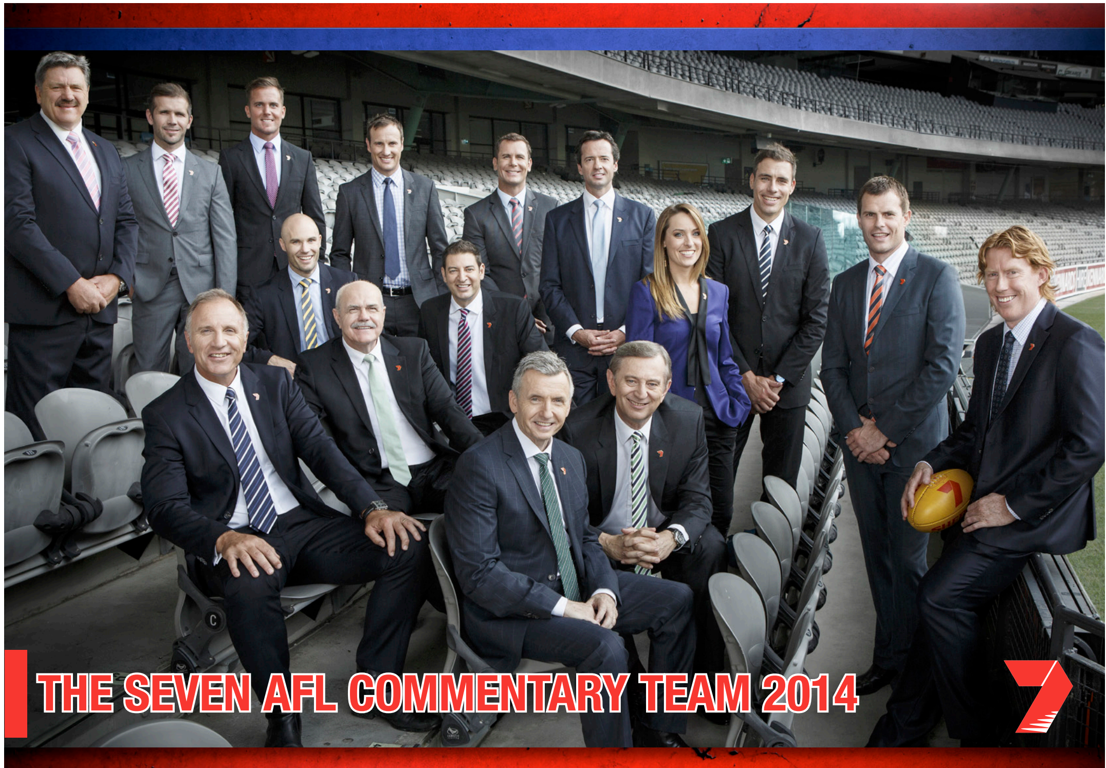
THE SEVEN AFL COMMENTARY TEAM 2014